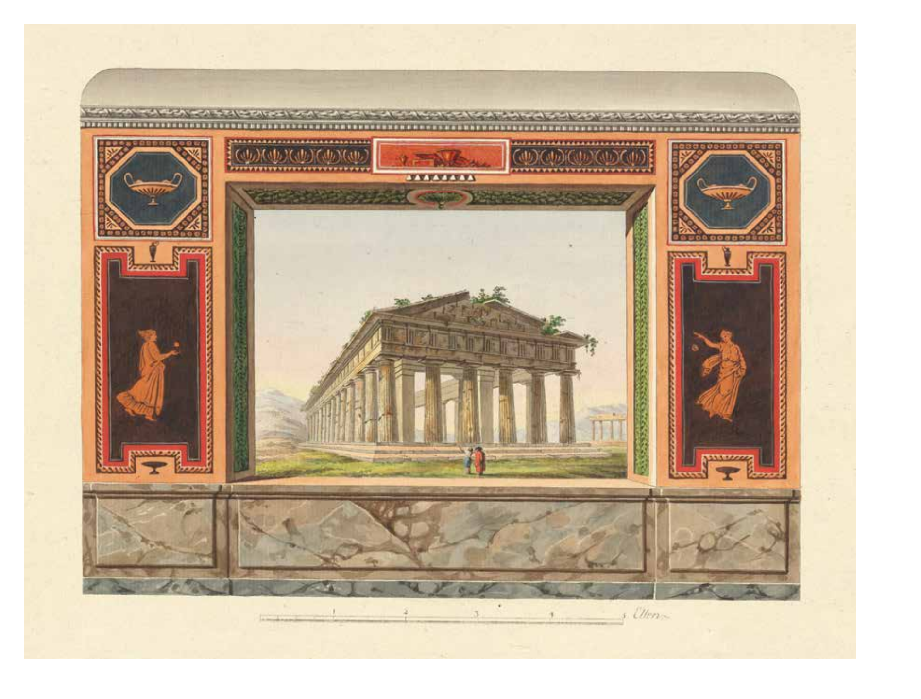
PLATE 4 In the Etruscan taste