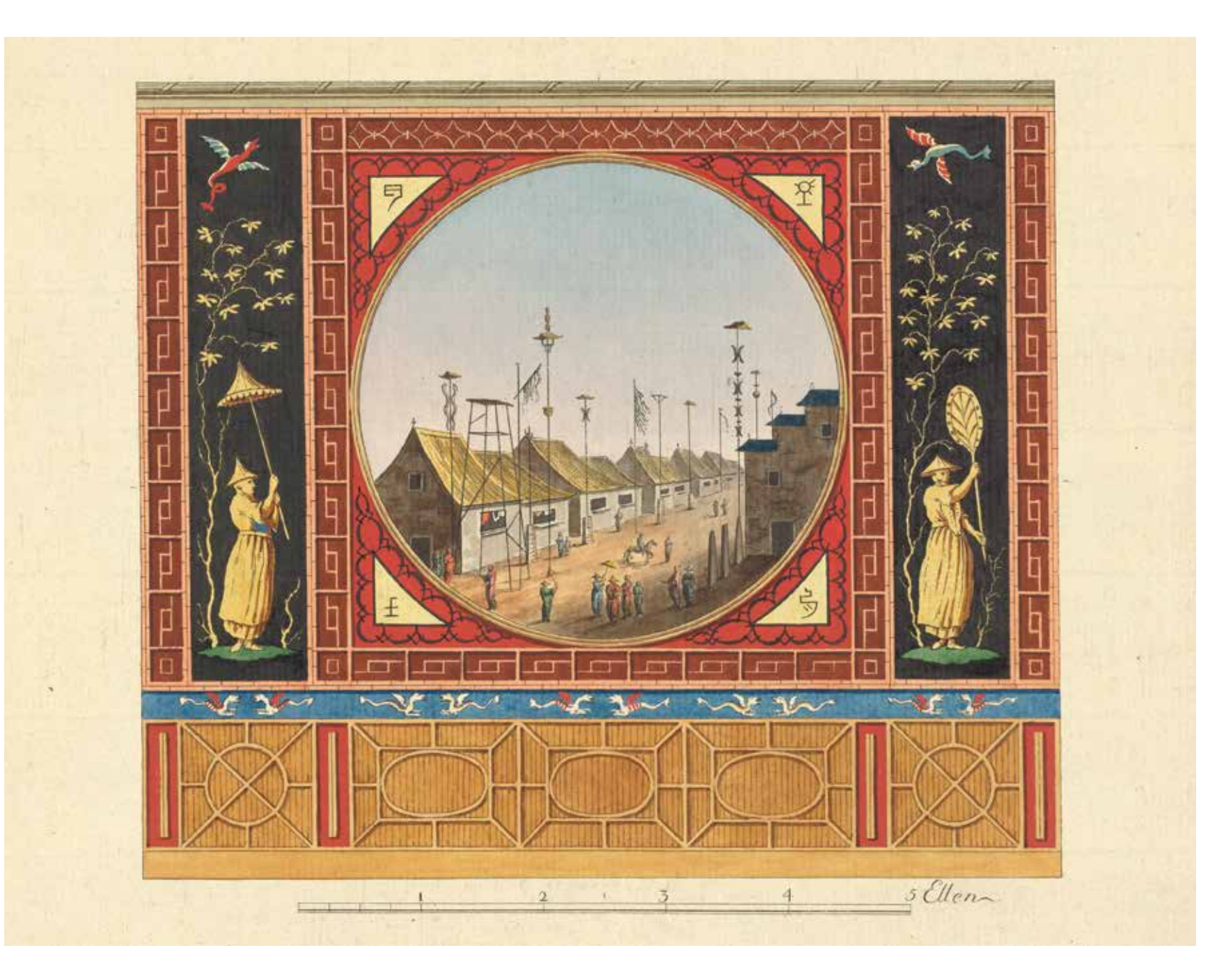
PLATE 12 In the Chinese taste