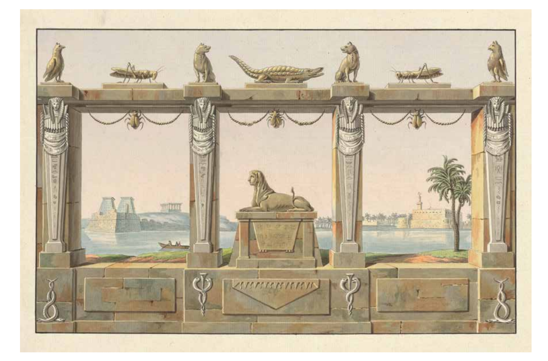
PLATE 2 In the Egyptian taste